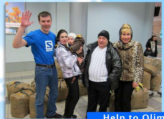
Help to Olim

Proverbs 3:27 "Do not withhold good from those to whom it is due, when it is in the power of your hand to do so."