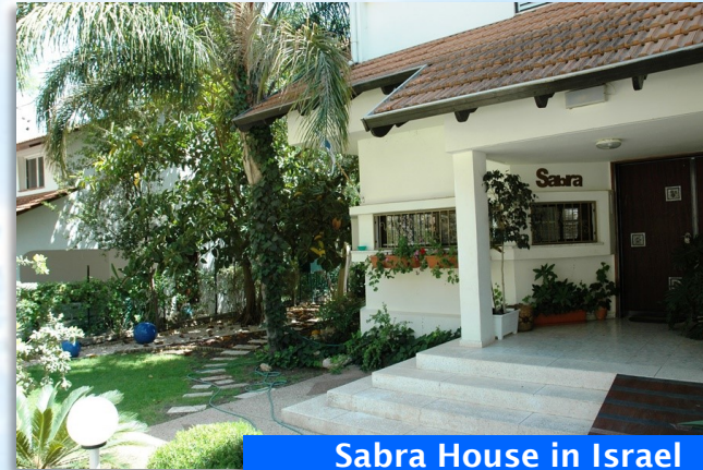
Sabra House in Israel