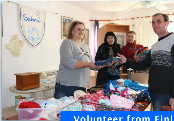
Volunteer from Finland

Sabra House in Afula serves as a bridge and is our center for: