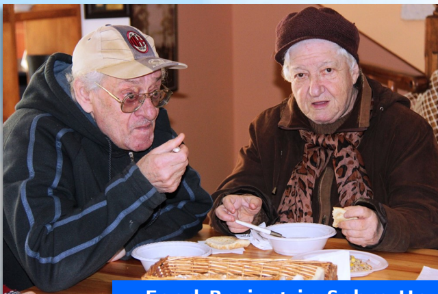
Food Project in Sabra House

A Jewish ministry in fellowship with Christians helping Jewish people in Israel and Russia