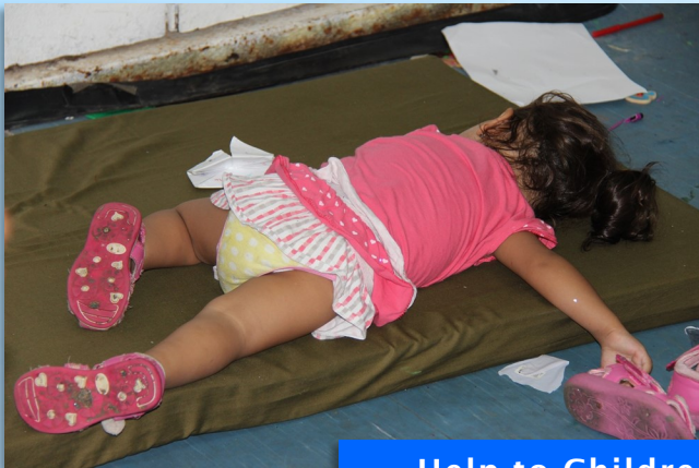
Help to Children