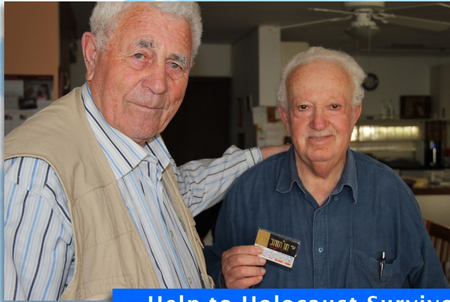
Help to Holocaust Survivors