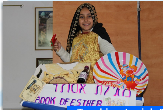
Teaching Jewish Roots